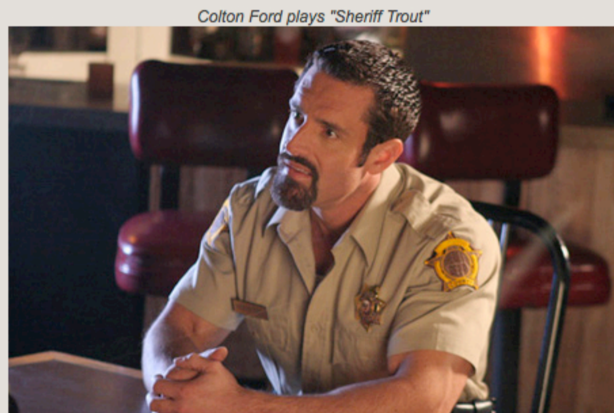
Colton Ford plays "Sheriff Trout"

How does the local sheriff, played by adult film star Colton Ford, deduce that he's dealing with a creature from Greek legend? The creature's victims who have been turned to stone aren't just statues: they also have veins and internal organs that are also made of stone.