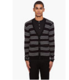
RAG & BONE Striped Henry Cardigan $255 - SSENSE