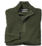
Vintage Quarter-Zip Sweater $98 - Johnston & Murph