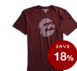
Billabong Get Up Raglan $34.50 $24.99