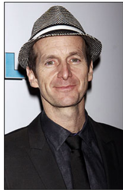
Denis O'Hare

Here! TV, America's premium gay television network, will present a new one-hour documentary focusing on Broadway Cares/Equity Fights AIDS in September.