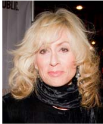
Judith Light

For more information visit www.heretv.com